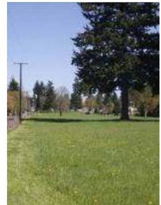
Site of Future Covington Neighborhood Park

Covington Neighborhood Park – Located on Northeast 94 th Avenue at 70 th Street in the Maple Tree/Five Corners area.