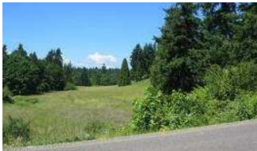
Site of Future Fairgrounds Community Park

Vancouver-Clark Parks and Recreation and Clark County Public Works will start construction on one new community park and two neighborhood parks this summer. For more information about any of these parks, visit www.clarkparks.org .