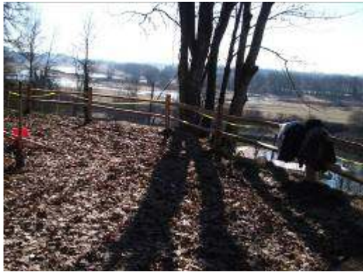
View of Ridgefield Wildlife Refuge and Columbia River from Eagle's View Park

RIDGEFIELD MAYOR AND RIDGEFIELD HIGH SCHOOL STUDENT TEAM UP TO DEVELOP A NEW PARK FOR THE CITY