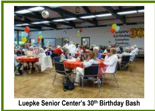
Luepke Senior Center's 30 th Birthday Bash