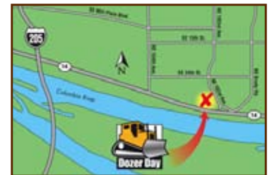
Just take the 192 nd exit on Hwy 14 and follow the signs

The Parks Foundation is pleased to partner with the Nutter Foundation in recruiting volunteers for Dozer Day 2010. For those of you who have never attended Dozer Day, it is a fun family event that puts kids close to-actually on and operating- dump trucks, dozers, and excavators. Volunteers, who must be at least 14 years old, are needed on Saturday from 12-5 and again on Sunday from 10-2 and/or 1-5 to help children on and off the machinery, monitor lines, and assist with check in, ticket-taking, etc. Visit www.nutterfoundation.org for all the details.